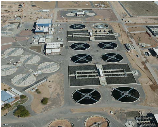
Clark County Water Reclamation District's main treatment facility