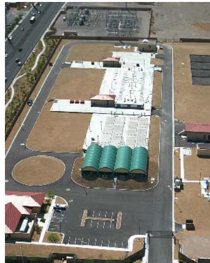
Desert Breeze Water Resource Center

Stormwater runoff from the Las Vegas Watershed constitutes only a small percentage (5 percent annual average) of flow returned to Lake Mead via the Las Vegas Wash. Current NPDES regulations require MS4 permittees to have programs that mitigate the impact of new development on the quality and quantity of stormwater. EPA’s guidance to meet these requirements encourages the capture and infiltration of stormwater runoff at each new development. Such an approach would be detrimental in our unique environment by causing selenium laden, high salinity shallow ground water to be forced to the surface into Las Vegas Wash. Furthermore, the Las Vegas Valley Flood Control Master Plan anticipates increased quantity due to development. The SQMC’s SWMP encourages surface conveyance of storm water to Lake Mead in the best quality practicable such that it may be available for municipal use.