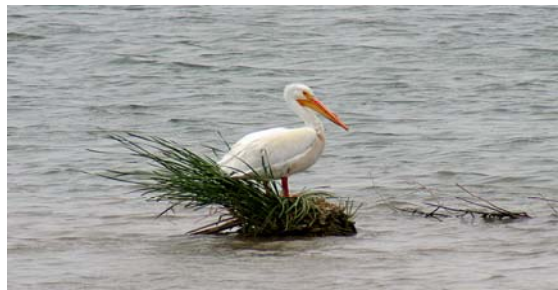
Pelican at the Las Vegas Wash