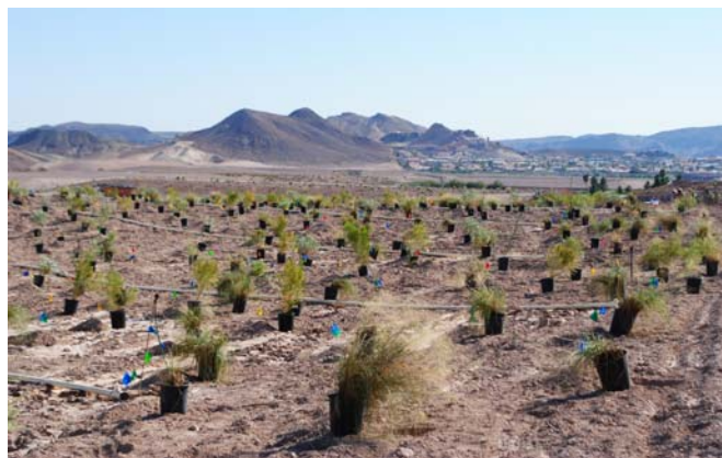
Revegetation efforts at the Las Vegas Wash