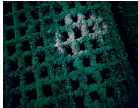
Quagga mussels at Lake Mead Intake No. 2

Quagga Mussels : Quagga mussels are an invasive mussel species that can overwhelm aquatic ecosystems due to their explosive growth. They were first discovered in Lake Mead in January 2007. The species can significantly alter water ecosystems by causing toxic algal blooms and a reduction in water oxygen levels. This can result in the killing of other aquatic species. Quagga mussels are also capable of overfeeding on algae which in turn can dramatically reduce the food source for other aquatic organisms. Furthermore, the species can clog water delivery infrastructure and poses a number of other issues for municipal water supplies (for example, treatment, cost of treatment, etc.). To date, water quality impacts to Lake Mead seem to be minimal, with a slight decrease in chlorophyll concentrations. The long term impacts are unknown. SNWA has implemented chemical treatment after the water treatment intakes to inhibit the growth of quagga mussels on infrastructure and has developed a routine cleaning schedule for facilities where chemical treatment cannot be applied.