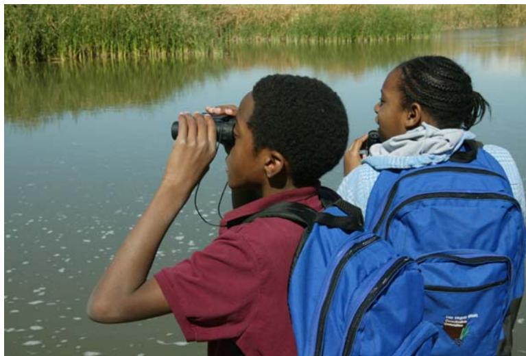
Students at Las Vegas Wash