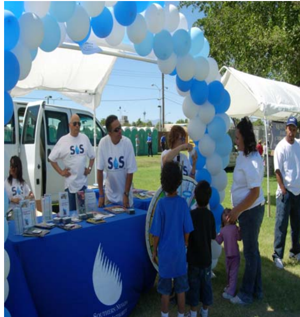
SNWA Community Outreach Booth

Most of the LVVWAC agencies maintain public information office's responsible for disseminating information to the community on their respective duties and issues. The LVVWAC agencies will continue to utilize these vehicles to communicate with their respective stakeholders, as well as to develop materials necessary to support LVVWAC's overall regional water quality goals.