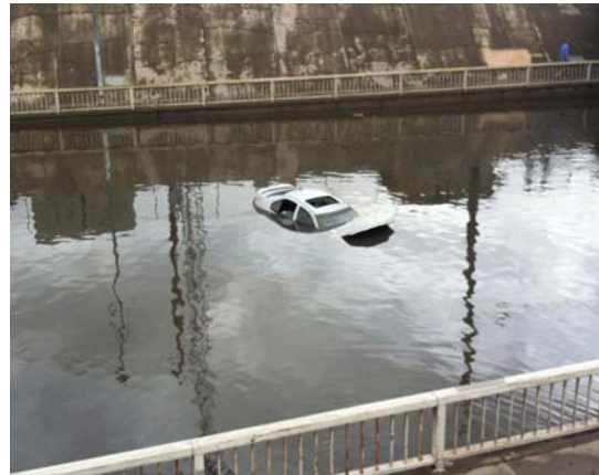
2012 Flood Event in Las Vegas

The CCRFCD also conducts public education to minimize public risks and to decrease the number of life-threatening flood related emergencies.