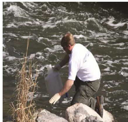
Retrieving water samples