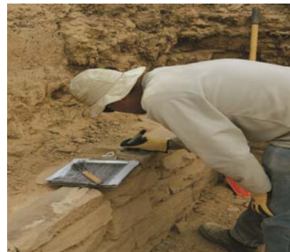
Archaeological site at the Las Vegas Wash